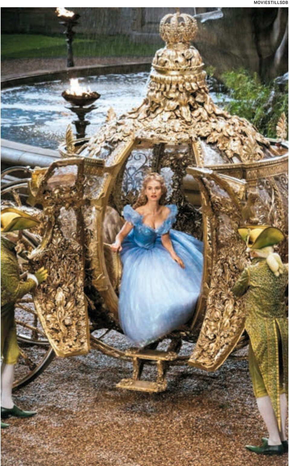
▲ Cinderella attends the royal ball in a pumpkin transformed into a coach in “Cinderella.”