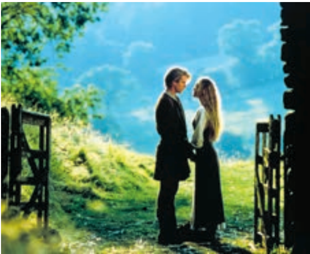
▲ Cary Elwes as Westley and Robin Wright as Princess Buttercup in “The Princess Bride.”

no matter how imaginative and “other” it may be, it remains a land where the features of our world are clearly discernible—perhaps even more clearly than they are in our daily lives. We watch fantasy in part to better understand our reality. We suffer from a dearth of great fantasy literature and fantasy films, however. Fantasy crafted without a strong sense of universal moral and philosophical principles easily slips into the realm of the absurd or even perverted, where the “fantastic” elements are merely the grotesque productions of a twisted imagination. True fantasy, on the other hand, reflects reality and promotes the good, Continued on C2