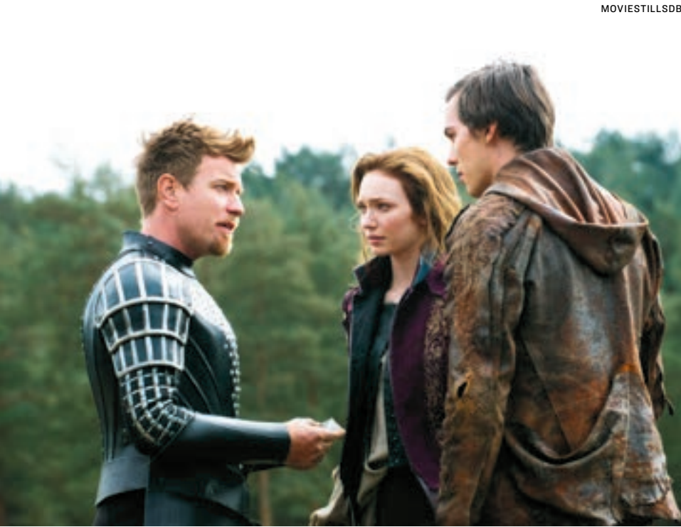
▲ Ewan McGregor, Eleanor Tomlinson, and Nicholas Hoult in “Jack the Giant Slayer.”