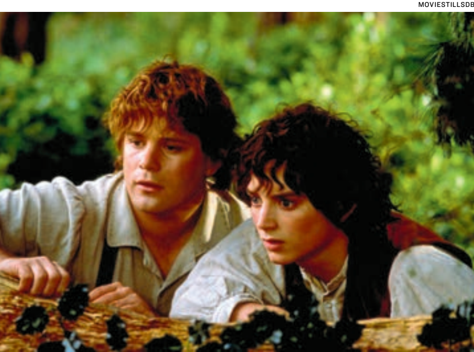
▲ Sean Astin and Elijah Wood in “The Fellowship of the Ring.”